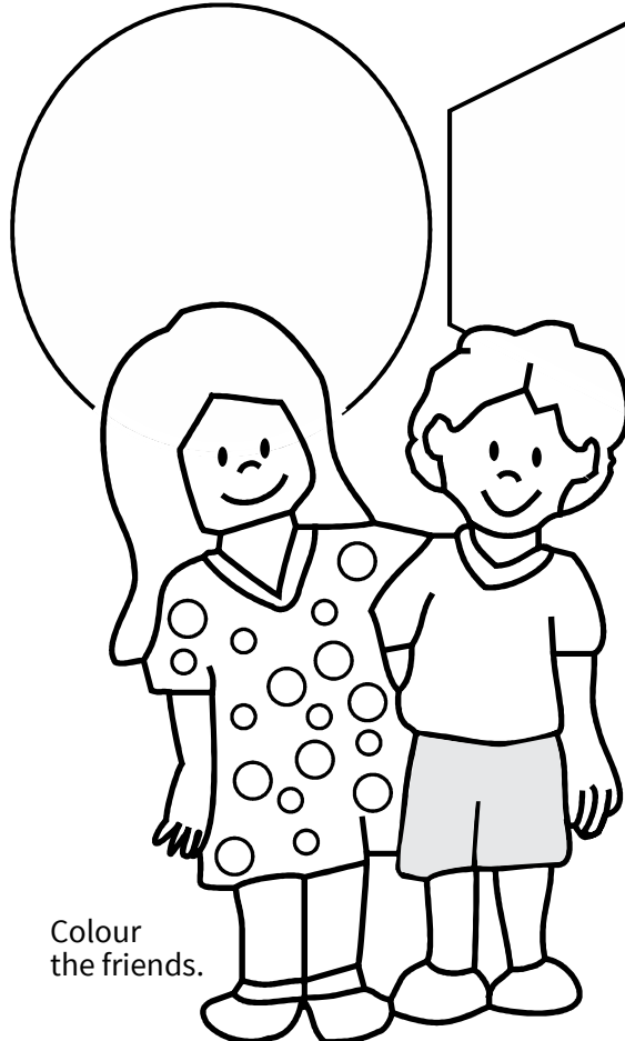
Colour the friends.