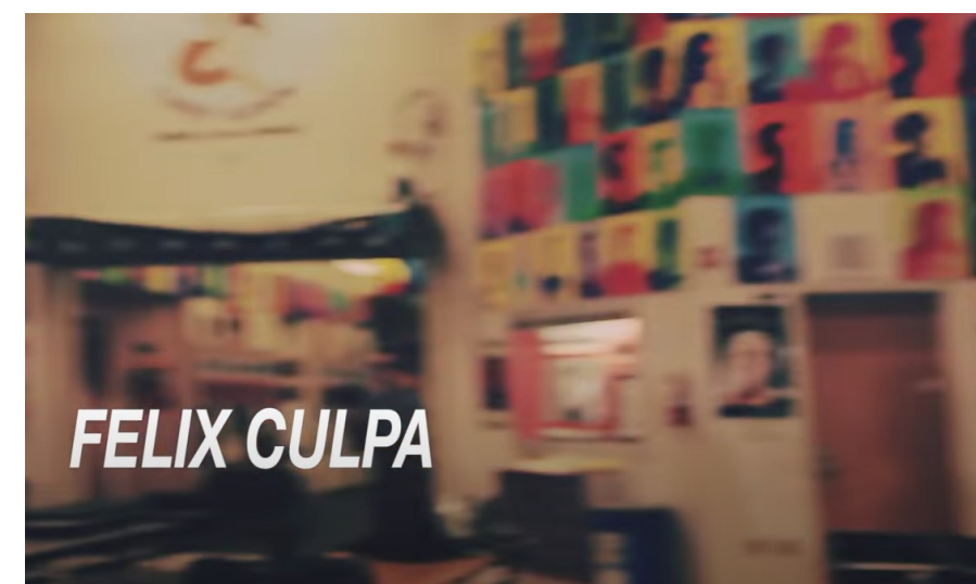
Youth Felix Culpa – Kings Kaleidoscope