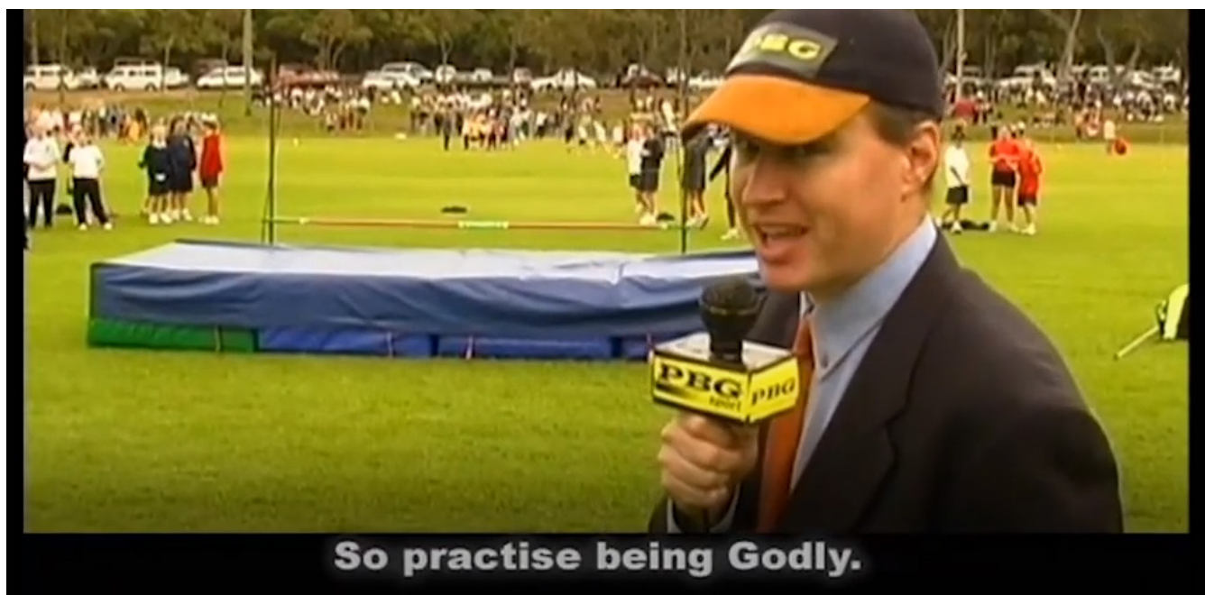
Practice Being Godly - Colin Buchanan

Play the song on the TV. If your kids are old enough to be in Kids Church, ask them if they remember the actions.