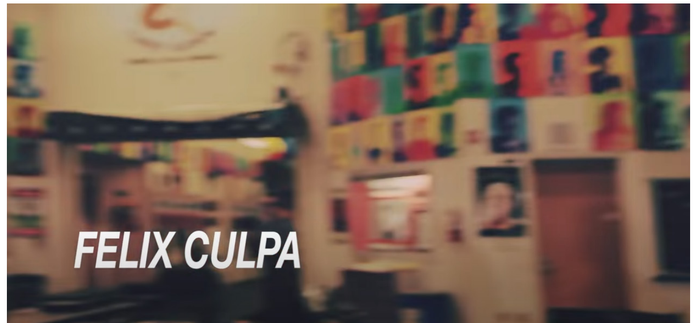
Felix Culpa – Kings Kaleidoscope

"From His wounds a rushing torrent that can wash it all away / Grace upon grace, upon grace upon grace."