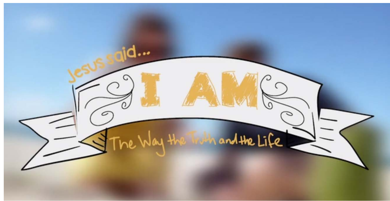
Youtube - Living Church - I am the Way, Truth, Life.

Explore this passage a little more by watching this week’s I AM video: