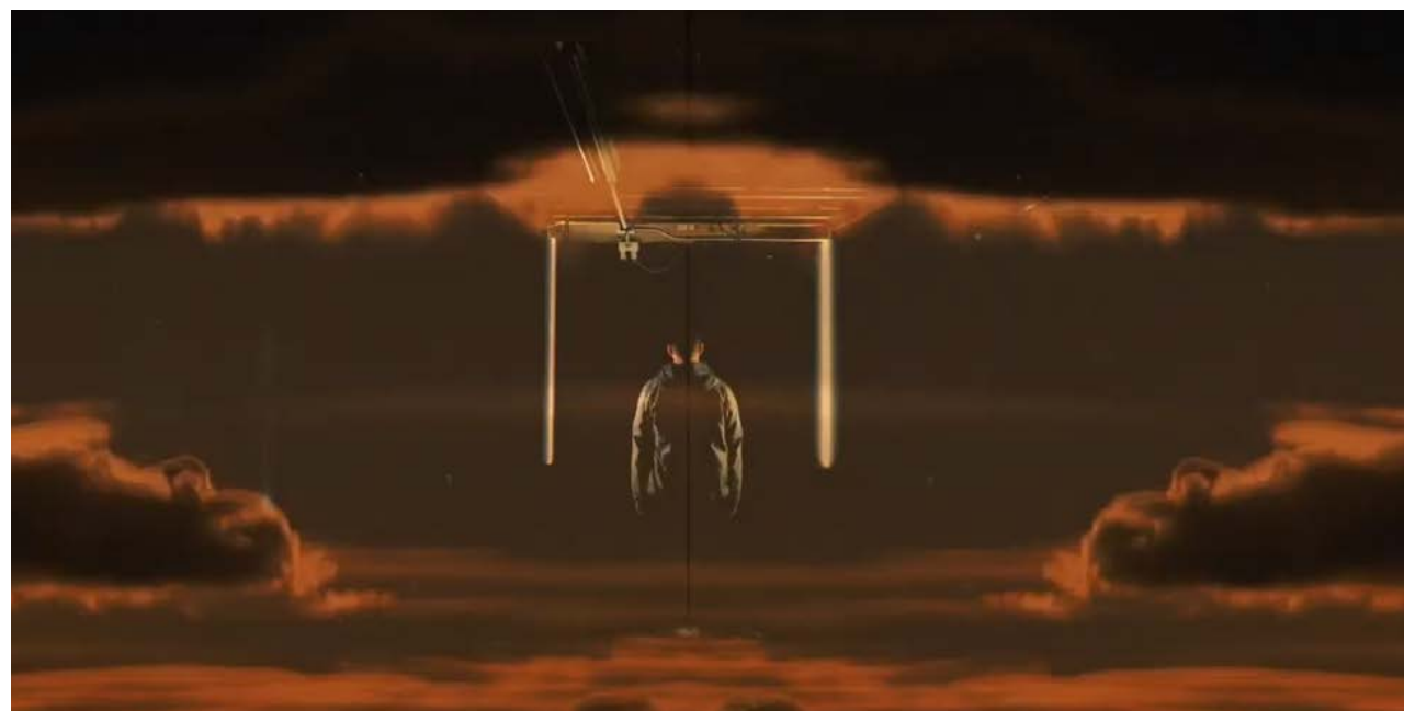
Youtube: Street Lights I Am the Way, Truth, Life

What does Jesus tell his disciples to do when their hearts are troubled (worried)? Trust in God and in Him/Jesus